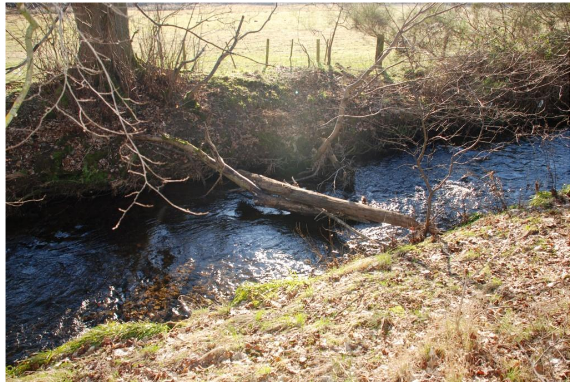
Picture 2, showing naturally existing LWD upstream of Fodderty Bridge (251249E, 859533N).

To help the river regain the natural habitat diversity required to support fish and invertebrates LWD will be installed in a way that mimics the natural input of trees from the riparian zone. LWD immediately has an impact on the hydrology and morphology of the river helping to create a diverse range of habitats and to trap fine silt. The Environment Agency Technical Report W185 summarises the benefits of LWD and its use as a management tool.