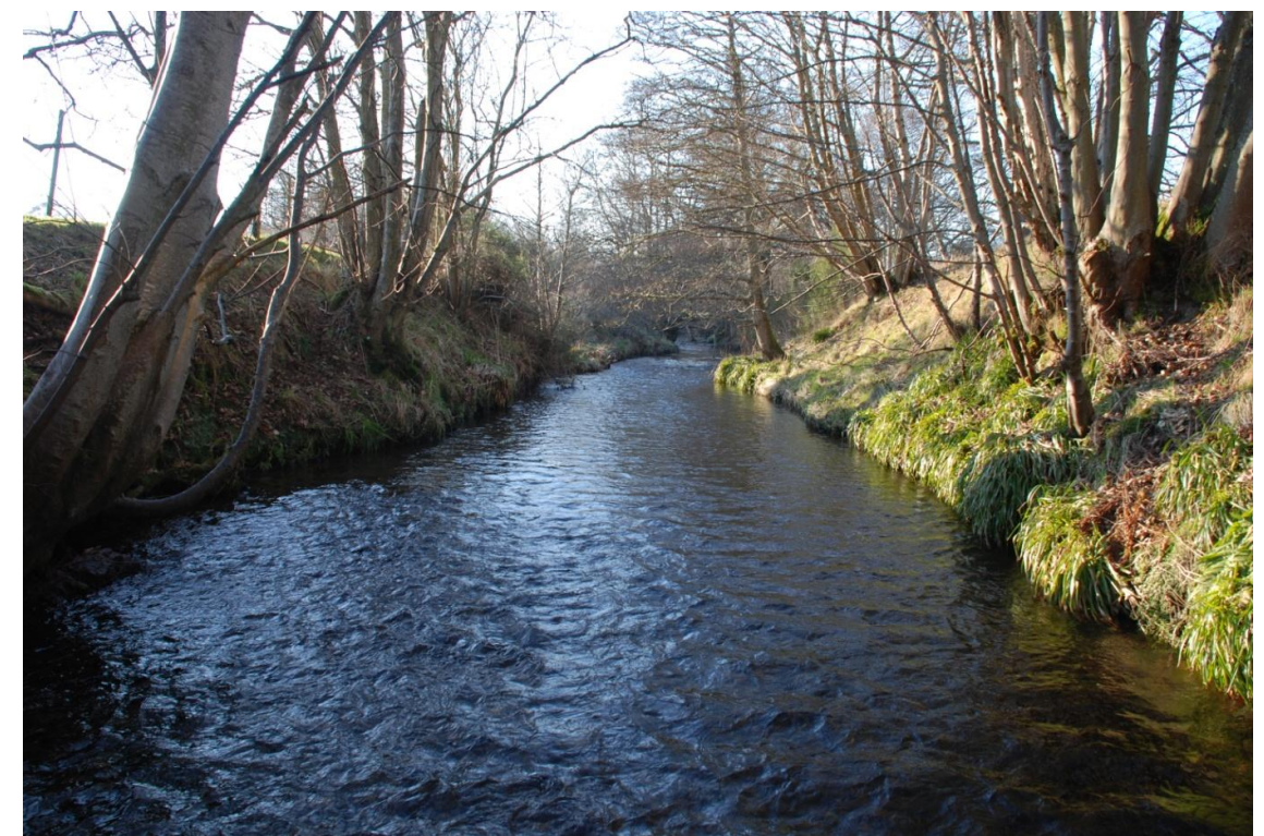
Picture 1, showing the section between Foderty House and Railway Bridge. Straight channel constrained within flood banks resulting in a uniform depth with limited in-stream habitat diversity and compacted bed.

In phase 3 as well as continuing the wider catchment work (INNS removal, tree planting, barrier easement and commercial forestry management) the in stream habitat restoration work has been continued in the next channelized section downstream from Phase 2 works. The section from Fodderty House downstream to the Railway Bridge (Appendix 2 -map) is owned by Lord Gough who is supporting the project. This section of the Peffery is relatively straight, of uniform depth, with little in-stream diversity or sorting of sediment (Picture 1). Although the bed is gravel it is compacted limiting spawning potential, there is very little deeper holding for larger fish and little sediment sorting or deposition to support invertebrates and lamprey. However, where Large Woody Debris (LWD) has fallen and been left in the river some of these natural features are beginning to return (Picture 2).